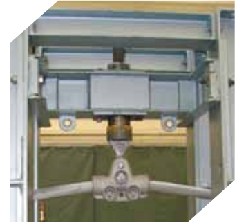
Laboratory Vibration Testing of CUSHION-GRIP Suspension

The level of protection provided by the CUSHION-GRIP Suspension and Support is comparable to a bolted clamp over armor rods, but without the material and labor costs associated with the armor rods.