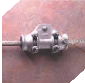
FIBERLIGN® Cushion Clamp for OPGW

Since 1998, the cushion concept has been field proven with the FIBERLIGN® Cushion Clamp for OPGW and the CUSHION-GRIP Clamp for T-2 conductors. Both of these PLP products have had broad industry usage and acceptance.